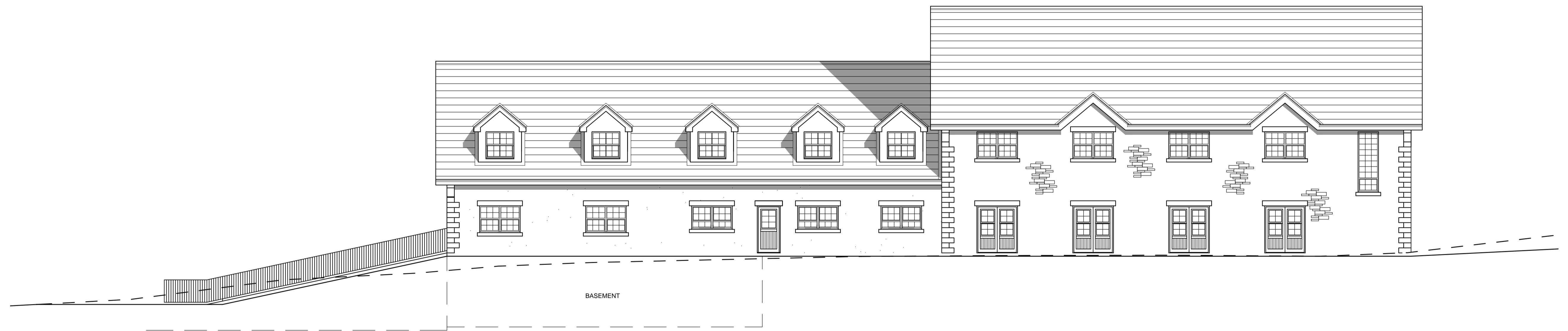
EAST ELEVATION 5 1:100