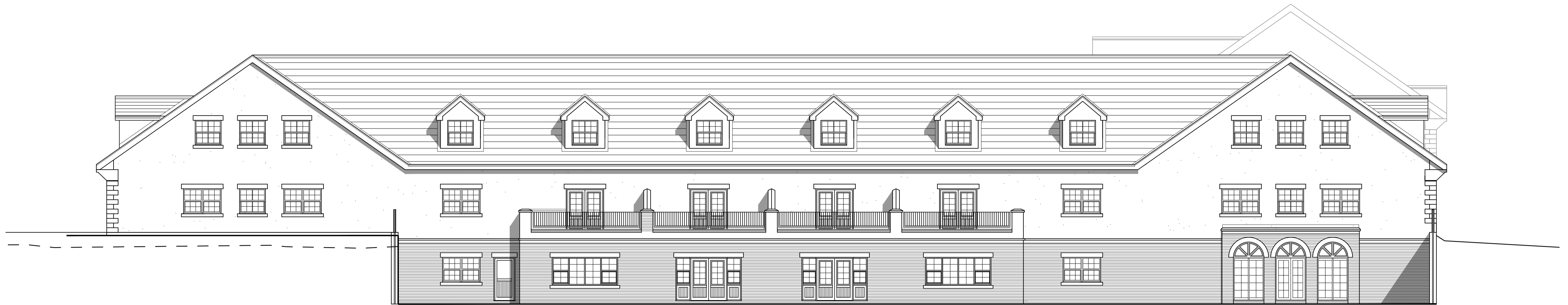
SOUTH ELEVATION 4 1:100